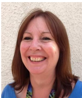
Learning and Growing Together